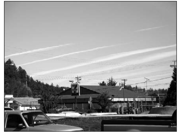
These photos show chemtrails in Reedsport, Oregon.