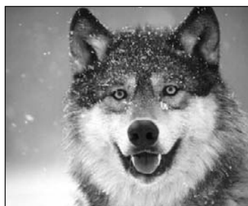
Gov. Sarah Palin's anti-wildlife policies included shooting wolves from helicopters.

"Instead, Governor Palin ignored our nation's leading wildlife laws and filed senseless lawsuits to pursue her anti-wildlife agenda. Palin's increasingly extreme anti-wildlife management policies included shooting wolves from airplanes and helicopters, using airplanes to track black and brown bears then shooting them from the ground, and the gassing of wolf pups in their dens. She even targeted wolves that had been part of a fifteen year long scientific study conducted by the National Park Service. All this, as well as her decision to fight much needed protections for both polar bears and Cook Inlet beluga whales,